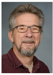
SAM Maintenance Supervisor